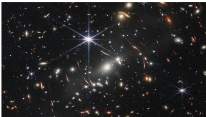
Universe by James Webb

November 26, 2022 UCLouvain, Auditoire Central Maisin 1200 Bruxelles